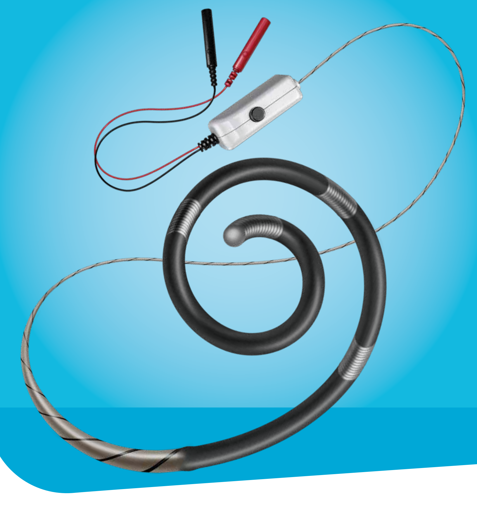
Wattson^{^{\mathsf{T}}}\ Temporary\ Pacing\ Guidewire \mathsf{Engineered\ for\ Efficiency}